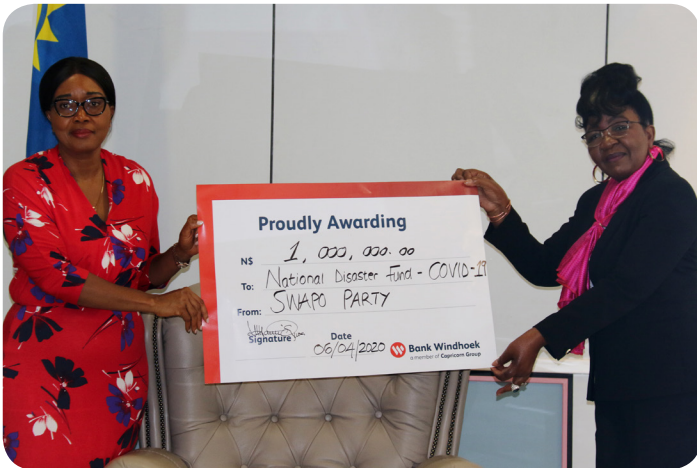
Prime Minister Dr. Saara Kuugongelwa-Amadhila receiving the donation from SWAPO Party's Secretary General, Hon. Sophia Shaningwa

Government has received monetary contributions and pledges to the value of N$ 28.5 million and in-kind donations worth 20.2 million, towards the National Disaster Fund account for COVID-19.