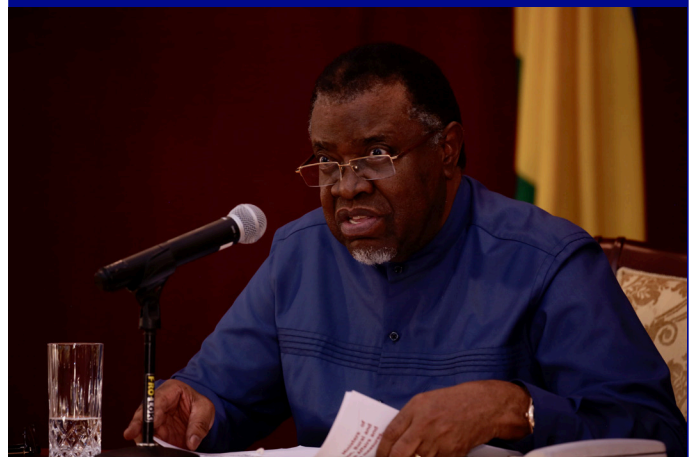
President, Dr. Hage Geingob.

The lockdown will be from 17 April 2020 (Friday midnight) to 04 May 2020 (monday, midnight). The country will effectively reopen on 5 May 2020.