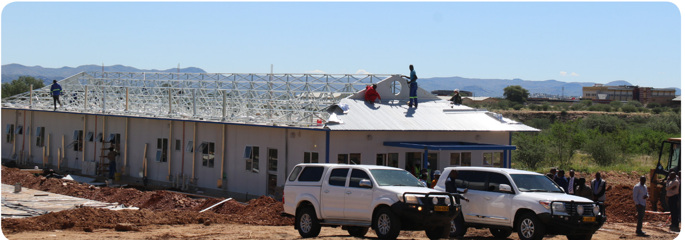
Isolation facility whconstruction.

P rime Minister (PM) Dr. Saara Kuugongelwa-Amadhila (centre in the picture) inspected a newly built isolation facility at the Windhoek Central Hospital (WCH), on 01 April 2020. The isolation facility built in one week has 12 fully furnished self-contained rooms for the Covid -19 patients.