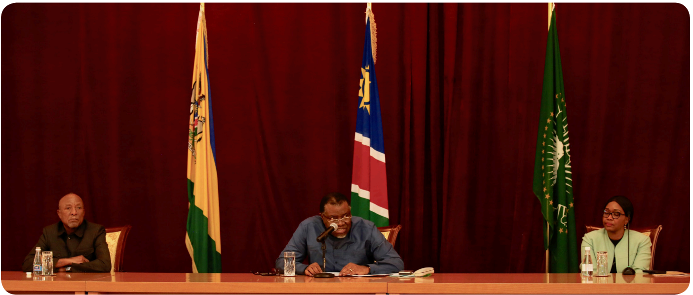
President Dr. Hage Geingob (centre), Vice-President Dr. Nangolo Mbumba (left) and Prime Minister Dr. Saara Kuugongelwa-Amadhila (right) during the lock down extension announcement.

Consistent with the announcement of the lockdown by the President, the Prime Minister has extended the permission to identified staff members to work from home. Hence, notice is given that: