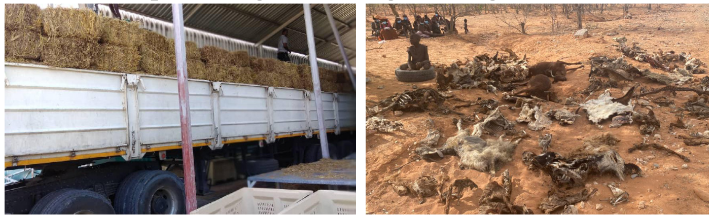
Seen here above is bale consignment dispatched to Kunene region as part of the disaster risk management, to assist the farmers whose livelihood is severely affected by drought and lack of grazing and the carccasses of farmers which died as a result of drought in the region.

The Office of the Prime Minister (OPM) through the National Disater Risk Management Committee are working closely with the Regional Disaster Risk Management Committees and Stakeholders in an effort to mitigate the drought and floods situation in the country. The two main affected regions are Kunene, parts of Erongo, parts of Omusati West with Kavango West affected by floods. Cabinet recently took note of the drought situation in the Kunene, parts of Erongo and parts of Omusati Regions due to insufficient rain in the 2020/2021 Financial Year; and endorsed the following immediate relief interventions: