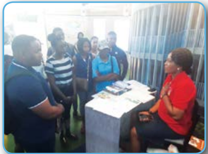
Visitors engaging the OPM stand during the Windhoek Show

The Judging Criteria was based on Presentation - First Impression, Promotion- message conveyed by