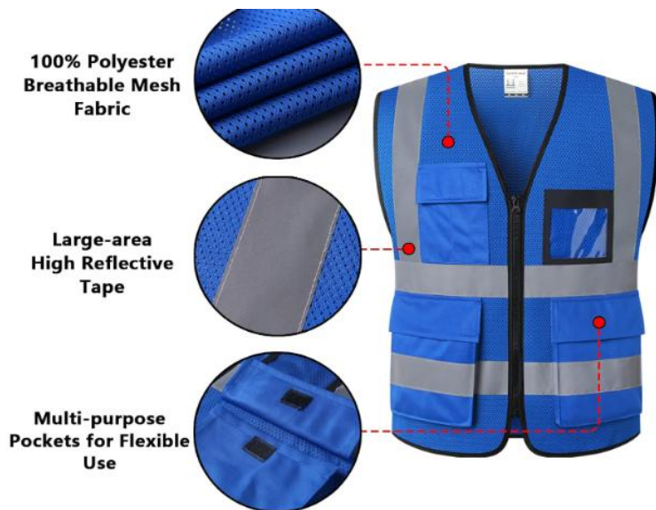
Figure 4 : Reflectors specifications